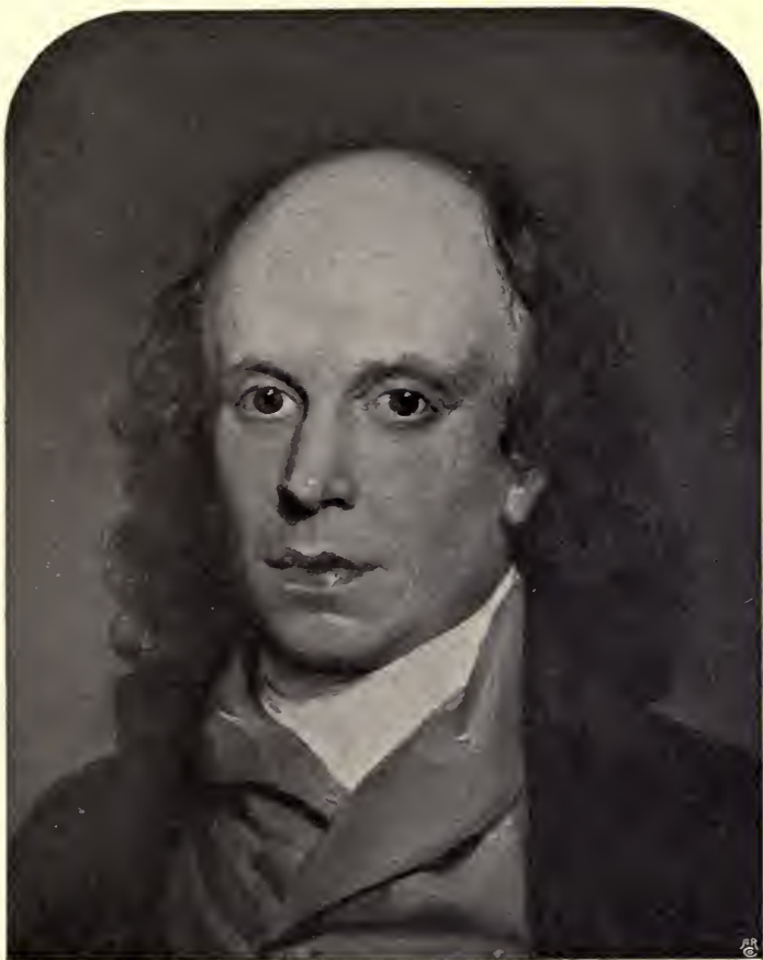
JOHN FLAXMAN, R.A.